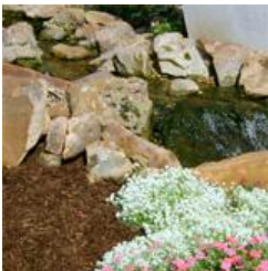
Saint Andrews Christian Church

3945 North Josey Lane Carrollton, Texas 75007 972.492.753 www.e-sacc.org